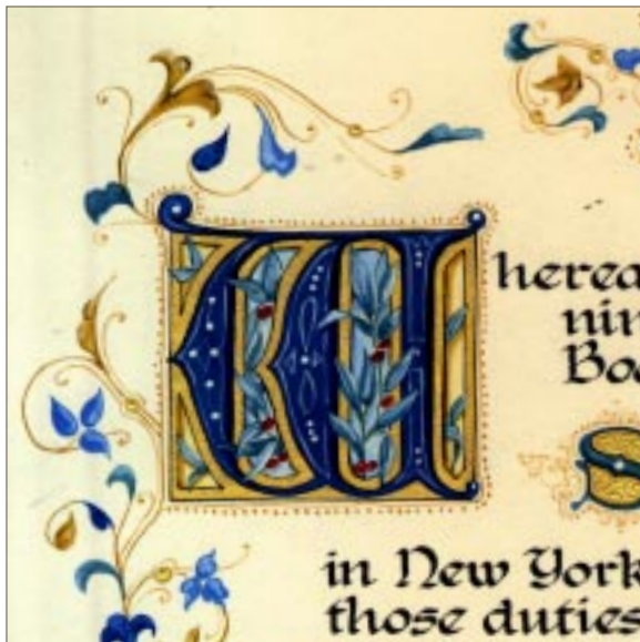
BOXED INITIAL WITH COLOR ILLUMINATION, 23K GOLD

The scribes who labored at reproducing manuscripts in medieval times would find, today, that the art of hand lettering remains a highly specialized, disciplined field. Below is a small sampling of our illuminated initials. Our materials include hand-ground Chinese ink, Winsor Newton colors and 23k gold.