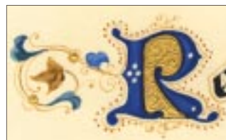
BRUSH STROKE CAP WITH TRACERY AND LEAF TRAILER, 23K GOLD