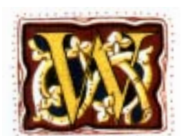
ITALIAN VINE, 23K GOLD